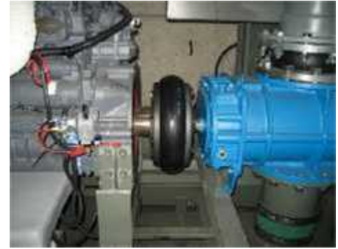
↖ ↑ DIRECT-DRIVEN VIA TYRE COUPLING